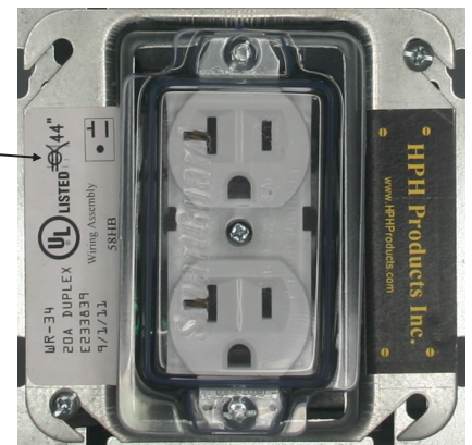
To an easy to identify Prefab assembly..

UL LISTED ASSEMBLIES PROVIDED WITH OR WITHOUT MC CABLE WHIPS